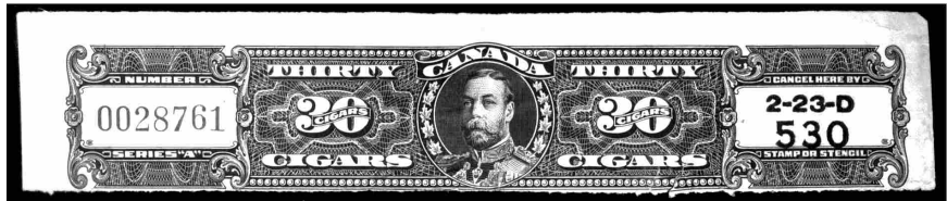
Figure 162: New 30-cigar denomination, prepared circa late-1929 as Series 'A'.