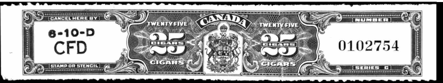
Figure 164: Series 'C' by BABN, small-strip format, issued 1935 onwards.