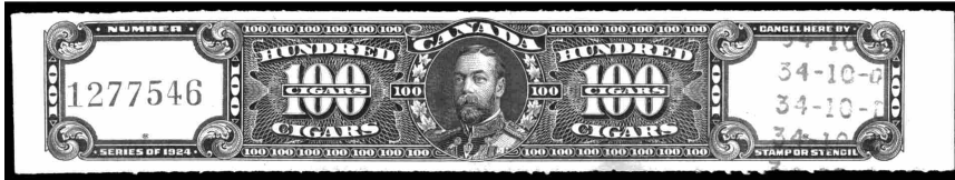
Figure 160: Series 1924 stamp continues the switch to the small-strip format.