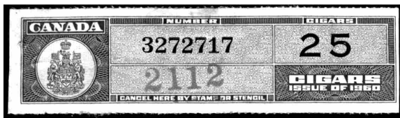
Figure 166: Series 1960, new design for the small-strip stamps.