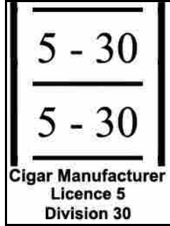
Figure 172: Example of the fourth style of Official Cigar Stamp Cancel, introduced 1915

In June of 1915, the regulations governing the excise stamps were amended to once again permit the use of a roller cancel by cigar manufacturers. These new rollers were of a simplified design, as illustrated (not to scale) at right in Figure 172, and versions other than the one shown here might exist. The amendment to the regulations specified that the roller was to be used to cancel the new small stamp for 10 cigars (Figure 159) prior to affixing it to a package.[180] However, an examination of used stamps of the period indicates that the new roller and old handstamp were both used for the new type of cigar stamps.