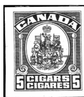
Figure 169: Series 1965, revised design for small stamps.