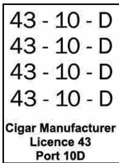
Figure 175: Seventh style of Official Cigar Stamp Cancel in which the distinction between cigar and tobacco manufacturers has been removed, introduced circa 1924

Starting September 15 th , 1921, the official cancels for cigar stamps were revised to replace the old Inland Revenue Divisions and Customs Ports with the new Ports of Customs and Excise. The change was made to both the wavy handstamp cancels and the roller cancels. Examples are illustrated in Figures 173 and 174 above. In these cancels the font and spacing of the letters and numerals varied. (This was also true of the earlier cancels illustrated in Part 8 of this work.)