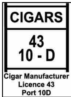
Figure 174: Example of roller cancel modified in late 1921 to incorporate the new Customs & Excise Ports as the sixth style of Official Cigar Stamp Cancel