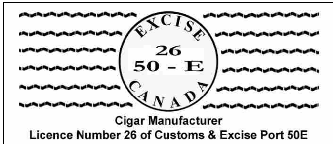
Figure 173: Example of the fifth style of Official Cigar Stamp Cancel as modified in late 1921 to incorporate the new Customs & Excise Ports.