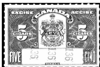
Figure 168: Circa late-1965, serial numbers discontinued.