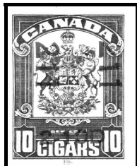
Figure 165: Series 'C' in new small format, 1938.