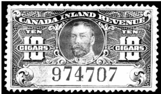
Figure 158: Series 1915 in a new small rectangle format, used concurrently with pre-existing strip format