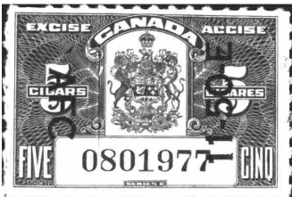
Figure 163: Series 'C' by BABN, rectangular format, issued 1935 onwards.