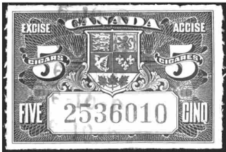
Figure 161: New bilingual design of rectangular stamps issued circa 1925.