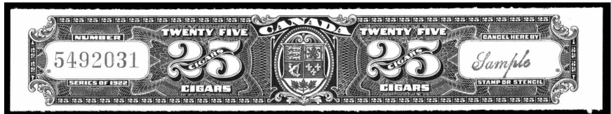
Figure 159: Series 1922 stamp in a new small-strip format, replacing the old long format. Among the last stamps produced by ABN, Ottawa prior to its transformation into CBN.