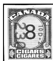
Figure 170: Simplification of the design in 1970.