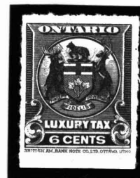
July 24th, 1925