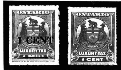
May 21st, 1925