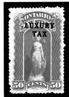
May 14th, 1925