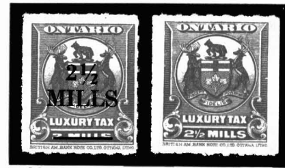
May 21st, 1925

The reasons behind the manufacturers refusal to absorb or collect the tax are given in the following newspaper reports: