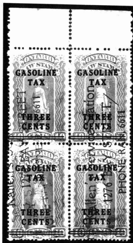
Figure 6: A block of four of the 3¢ Gasoline Tax overprint on the 40¢ Law stamp, cancelled by a rubber stamp impression that reads in three lines: "Kallen's Service Station / 1276 Bay Street / Phone RAN 6611."

The answer to this question can only be speculated. It is possible that the Controller of Revenue 'mis-spoke' when he commented in his January 1934 letter that: "a receipt is given to every purchaser of gasoline and that the necessary Gasoline Stamps are placed on the said receipt." [6] Instead, the true procedure may have been to place the stamps on a duplicate receipt that was retained by the vendor or inspector for record and audit purposes. This retention of the stamped receipts by vendors or inspectors would account for the present scarcity of used stamps and why all known used examples of the 3 and 15-cent denominations bear the cancel of the same service station on Bay Street in Toronto (see Figure 6).