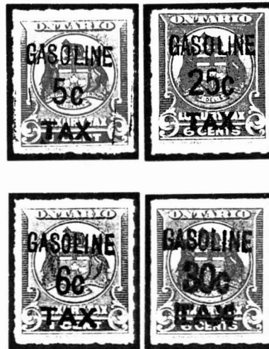
Figure 2: The 1929 (top) and 1932 (bottom) issues of Gasoline Tax stamps.

The 1935 audit report, as reproduced below, along with the 1932/33 and 1933/34 entries noted above, provide evidence as to the production of the gasoline stamps and the status of the stamp illustrated below in Figure 3. This 6-cent stamp is not surcharged, does not bear the words "gasoline tax" and has a red, horizontal line deleting the "luxury tax" inscription.