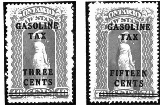
Figure 1: Examples of the First Issue of Gasoline Tax stamps.

negligible number of the 70, 80 and 90-cent Law stamps were sold, while the number of 5, 40 and 60-cent Law stamps sold was substantially less than other denominations under $20. In fact, with the exception of the 5 and 50-cent values, none of the Law stamp values used for Gasoline Tax stamps were retained when the First Issue of Ontario Law stamps were withdrawn and replaced on January 1st, 1929.[10]